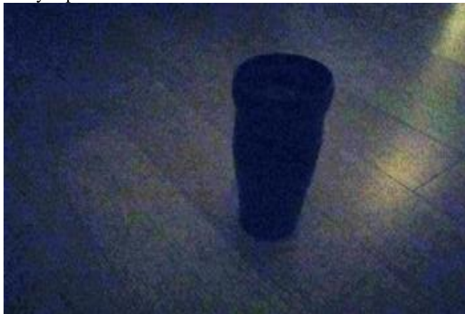
Original low light image.

It is necessary that the values of PSNR and SSIM values must be greater and the ILNIQE values must be smaller than the state-of-the-art methods. By using the above parameters, it is proved, that our model has shown better results in each and every aspect.