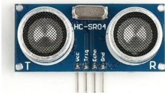
Fig. 2. Ultrasonic Sensor.

Some species like a Palawan swiftlet is float always inside in the darkness of river cave. They are use this methodology for the migration as they are nocturnal and flash cannot be possibly used. The same concept is recruit in these sensors where in here they support in the migration of the visually impaired. It calculate the distance between the object present on their way and the person. This is same as the function of a stereoscopic sonar that is used to determine the depth of objects undersea.