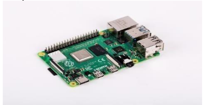
Fig. 5. RASPBERRY PI.

is just like a debit card and so it is movable. It makes smooth the work and it create a principles in studyingdifferent computer languages. It can be switch PCor TV as well. It can work like a hard drive because of memory card inserted in the raspberry pi. Here raspberry pi is mainly used to find out exactly