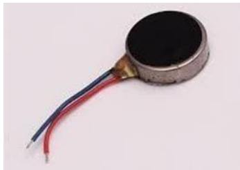
Fig. 3. Vibration Motor.

VIBRATION MOTOR--- Vibration motor have been around 1960s. In 1990's people were needed the vibra-call in their cell phones that is the reason they were invented the vibration motor. Especially, Pan cake vibration motors are the widely used ones as they are compact and trouble free. This type of motors are easy to be suited into all kind of system as they need exterior moving parts. It also have sticking support that would be possible to be easily fixed to any surface. They have interior H-circuitry. Here it is present as a means to alert the person ready for if the ultrasonic sensor has predicted an object within a specific distance.