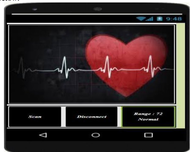
Fig.10. shows the heartbeat rate of the sole.

The differentsolution of the proposed model are shown below: