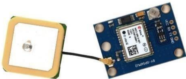
Fig. 4. GPS.

3. GLOBAL POSITIONING SYSTEMS-- Here GPS included with the aim of detecting the location of the person, such that it can be send the notification to the user's pre-decided friends or families when the person is found in any emergency conditions. It performs on the method of trigonometry. It can detect the location from the range determine to the satellites. It measures the far between the satellite and device by transmitting the location along with the satellite at the speed of light and finally ends up when the calculation has done. Thus, the exact position is obtained.