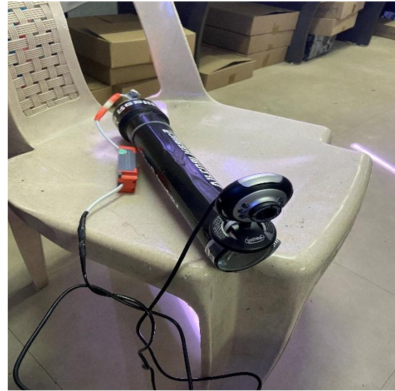
Figure 2: Transmission light device

In this module, the virtual screen is a screen where the input image can be touched .The OHP sheet is engraved with the items like hearing protection device, powered air purifying respiratory system, Foot protection, belt and D-rings, clothes, self-rescue device. The light is passed through the Over Head Projector(OHP) sheet to the convex lens. The refracted image is the resulting holographic view. The user selects the required icon. This activity is captured by the camera and the input image is displayed on the monitor using track-V12 software which has four co-ordinates. It can also have x or y corresponding value. The camera used here is web camera of 3.8mm lens.