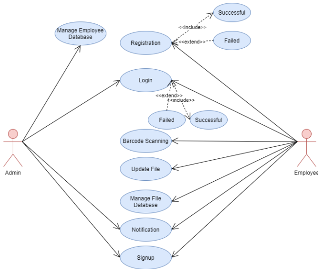
Fig. 1. Use Case Diagram

Once the registration is completed employees can do the following task.