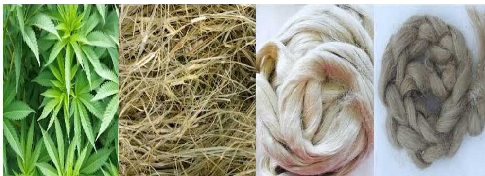
Fig. 2. Stage Transformations of Natural Hemp Fiber

The rudimentary aspects i.e. thickness and attributes of usual fibers differ noticeably based on the following important criteria such as topographical basis, precipitation during evolution, source, maturity, and score with separating practices.