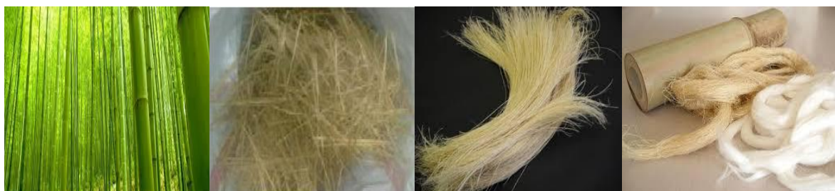
Fig. 3. Stage Transformation of Natural bamboo fiber