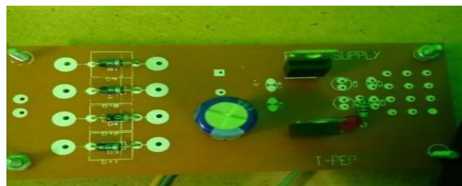
Fig.2. Power Supply

The air conditioner voltage, regularly 220V rms, is associated with a transformer, which steps that air conditioner voltage down to the degree of the ideal dc yield. A diode rectifier at that point gives a full-wave corrected voltage that is at first sifted by a basic capacitor channel to deliver a dc voltage. This subsequent dc voltage as a rule has some wave or air conditioning voltage variety. A controller circuit evacuates the waves and furthermore continues as before dc esteem regardless of whether the information dc voltage changes. This voltage guideline is generally gotten utilizing one of the mainstream voltage controller IC units.