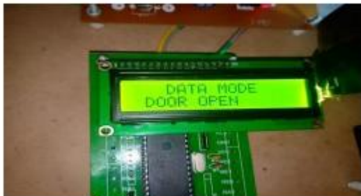
Fig.9. Door output

After displaying the LIFI will transmit the data to the photo detector. Then it will receive the function and control the door. The light will display the function light door open, again we press the same control the LCD will display as 'DOOR CLOSE'. E.g. Useful for Huge Malls, Hotels, Restaurant.