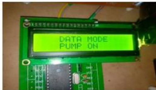
Fig.11. Pump Output

The figure 11 shows the device control command for the given data. At the initial stage the LCD will display data mode or voice mode. At the initial stage, we transmit the data to the controller. It will control the device-Pump. Then LCD displays the data mode. The data is fixed and the first controller of pump is pressed. Hence data will be transmitted and the function of LCD is to display the function line, 'PUMP ON'. After displaying the LIFI will transmit the data to the photo detector. Then it will receive the function and control the Pump. The light will display the function light is 'PUMP ON', again we press the same control the LCD will display as 'PUMP OFF'.