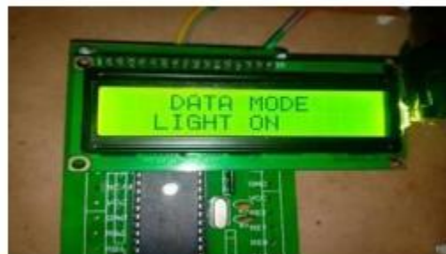
Fig.12. Light Output

The figure 12 shows the device control command for the given data. At the initial stage the LCD will display data mode or voice mode. At the initial stage, we transmit the data to the controller. It will control the device-Light. Then LCD displays the data mode. The data is fixed and the first controller of pump is pressed. Hence data will be transmitted and the function of LCD is to display the function line, 'LIGHT ON'. After displaying the LIFI will transmit the data to the photo detector. Then it will receive the function and control the Pump. The light will display the function light is 'LIGHT ON', again we press the same control the LCD will display as 'LIGHT OFF'.