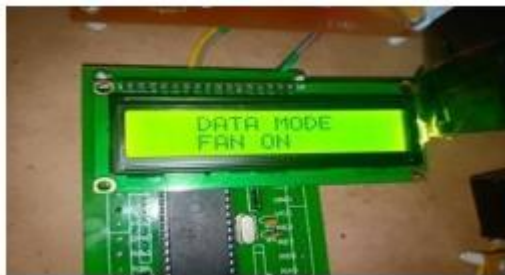
Fig. 10.Fan output

The figure 10 shows the device control command for the given data. At the initial stage the LCD will display data mode or voice mode. At the initial stage, we transmit the data to the controller. It will control the device-Fan. Then LCD displays the data mode. The data is fixed and the first controller of Fan is pressed. Hence data will be transmitted and the function of LCD is to display the function line, 'FAN ON'. After displaying the LIFI will transmit the data to the photo detector. Then it will receive the function and control the door. The light will display the function light is 'FAN ON', again we press the same control the LCD will display as 'FAN OFF'.