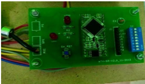
Fig.4. APR Voice Board

APR9600 voice chip as the center of the circuit and understands the capacity of auto recording and playback. It utilizes power enhancer chip JRC286D to enhance the sound and improve the volume. The voice recording and playback circuit is generally utilized in regular day to day existence. For instance, the leaving message and reaction of the phone, game machine, and toy voice recording and playback, reading a clock of the clock or caution, selling items and control of the family unit apparatus, and so on. The planned circuit control is simple ,great sound and huge volume. It very well may be recorded and played for ordinarily and has solid capacity of movability. The designed circuit control is easy.