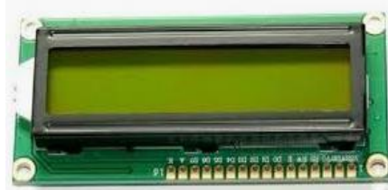
Fig. 4. 16*2 LCD module

The planned LCD panel of liquid crystal is seen as the focal light of the research displays more than 16 parts and 2 columns with some detail in synchronous shape. In order to explain the circumstances of a framework at once, it is essential for the proposed LCD display to demonstrate the figures announced by the used sensors as a few credit. The partnership strategy is presented as the graph shown in the Fig.4 graph generated by the Frizzling system interfaced with the Arduino surface.