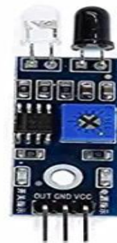
Fig. 5. IR sensor

For the identification of objects, infrared sensor is used. We are tracking vehicle movement and pace on a high level in our proposed system for the operation of automobiles. IR with ground three pins, voltage, info. That's the microcontroller.