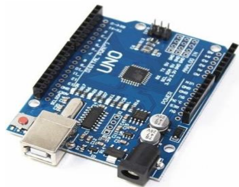
Fig. 3. Arduino

We use ARDUINO microcontroller to design the proposed system, as input and output interfaces as well as processing units. Arduino uno has 28 pins that are classified as D0 to D13 digital and analog pins. Remote ports are linked to all digital sensors. All analog sensors are connected to analog port from A0 to A5. The 8-bit microcontroller has a memory of 32 kb for processing and files. Frequency of operation is 16MHz. We use ATMEGA328 SMD IC for ARDUINO development board.