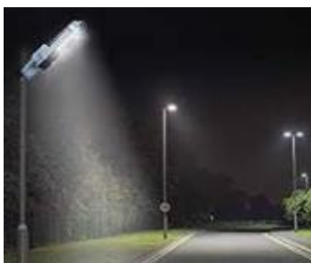
Fig. 7. Street light

LED LIGHTS of 230V are used as highway street light. Both LEDs for a brighter and dimer case are powered by a PWM technique. All are operated by microcontroller traic or relay.