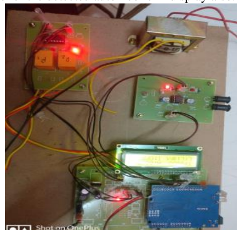
Fig. 9. Output Result1.

All input and output modules were interfaced successfully with the microscope. The controller has performed the results and performed them as required. In the LCD and IOT modules we got light and entity counts. Light automated monitoring dependent on LDR status was observed. Count and level of the detected automobile in display also.