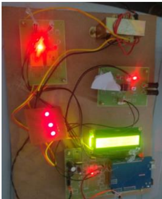
Fig. 10. Output Result2