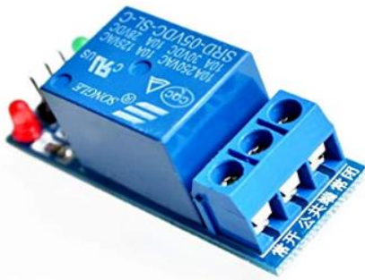
Fig. 6. Relay Module

Relais operation mode is usually shut down. When a high-relay input is switched on a short circuit and a low-relay input is enabled.