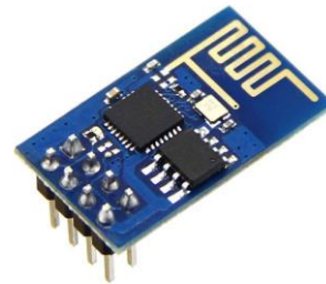
Fig. 8. ESP Module

receiver. The modem voltage is 3.3V and the power consumption is 100 mA. The 2 GPIO pins hold 8 holes. It includes 512 KB of flash storage memory. The main role of IOT in the project is the sending of data to the ESP8266 module by the micro-controller. It sends moisture, temperature and light data to the local ESP 8266 server. When the same register has been accessed at the receiving end, the user will access data.