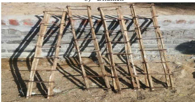
Fig. 1 View of bamboo reinforced beams with steel stirrups