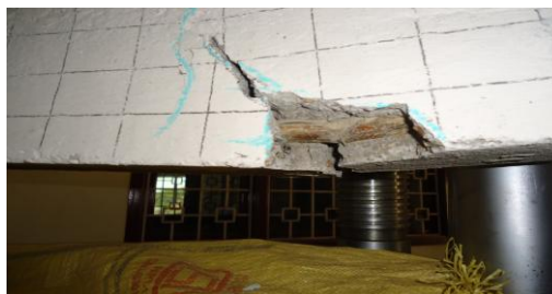
Fig. 4 Cracking pattern of bamboo beams