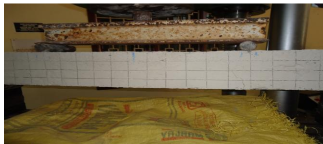
Fig. 2 Test setup of three point loading

Flexural strength test — The test was conducted on Universal Testing Machine. The test setup in Figure 2 shows the load transfer mechanism as a two point symmetrical loading through rigid steel girder. The span of the beam was 1000 mm between the supports, thus the flexure span was the middle span of length 333.3 mm. The crack patterns were drawn on the beam directly. The test was conducted till the ultimate load was obtained. The size of the beam adopted for testing was 100 x150 x 1200 mm.