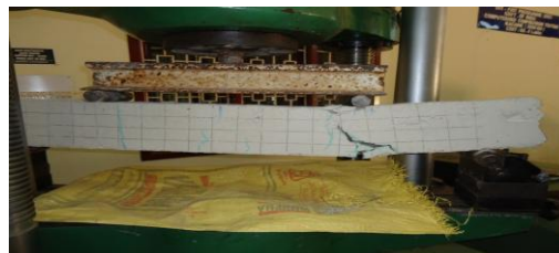
Fig. 3 Deflected view of bamboo beams

One specimen of concrete beam reinforced with steel (RCC), two specimens with uncoated bamboo reinforced sections, two specimens with bamboo reinforced section coated with araldite and two specimens with bamboo reinforced section coated with bitumen were tested for flexure. Beam size of 100x150x1200 was adopted for all the sections. The maximum flexural strength obtained from the experiment is tabulated in Table 1.