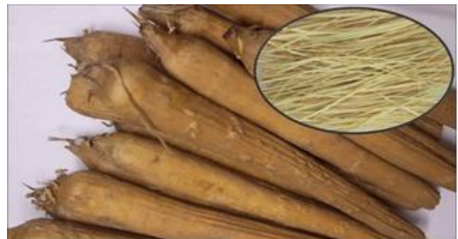
Fig.1 Tender palm shoots and central fiber

evaluated natural fiber as an alternative to man-made fiber in composites. In the present work, natural fibers are added so that at least a small quantity of plastic which is equal to the weight percentage of fiber is bared from usage. A comparative study was done on the effect of adding different proportions of reinforcement fibers (tender palm shoot central stem and palmyra palm fibers) and Al powder in epoxy resin. Epoxy is a well-known thermosetting plastic and it is widely used because of its low cost and easy formability. Despite its great potential, there is a negative effect on the environment because of the post consumed epoxy products, Virgin epoxy is not bio-degradable and on incineration of epoxy, toxic gases are released which are harmful to the environment. The tender palm shoot ( Borassus flabellifer ) is the part emerging from the centre portion of tender palm fruits. These shoots are thin and about 150 to 200 mm long.