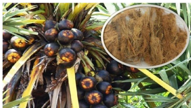
Fig. 2 Palmyra palm fruit with fibers

It is starch based root (shown in figure 1) surrounded by a thin fibre layers and a central stem. The part used for extraction of fiber is the central stem of the shoots which is a leftover part of the tender palm shoots.