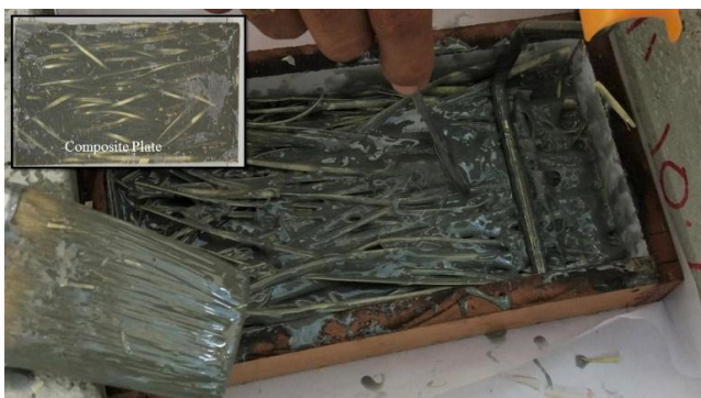
Fig.3 Hand-layup of S2, S3 samples

First a sample (S1) with only epoxy was made for comparative studies. New hybrid composite with four different combinations (S2, S3, S4 and S5) with 5wt%, 10wt% of reinforcement like tender palm shoots, aluminium powder and palmyra fiber aluminium powder with varying weight percentages were produced in rectangular wooden mould which is shown in figure 3.