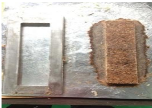
Fig. 1: Specimen of particleboard

The mixture of these materials is incorporated into the mold with different sizes. The zinc sheets were placed at the bottom and the top of the mold. Then, the sample of particleboard was fabricated using a Hot press machine with the molding temperatures, pressing times and molding pressures were, respectively, 160°C, 5 min and 60 Pa. Fig. 1 below shows the process of producing the sample of particleboard.