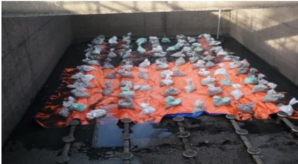
Fig. 2. Complete works by placing sand pages

Plastic sheets will float to the surface of the aeration tank because of the air flows through diffusers. Hence sand pages were used to force the plastic sheets to become stable. Sand pages as well as the water above the plastic sheets afford enough gravity force to hold the plastic sheets at the bottom of the anoxic zone. Fig. 2 illustrate placing down the plastic sheets and complete work after putting down the sand pages. Then number of sand pages were placed in each aeration tank was 105 pages. Sand pages were distributed and placed on every diffuser located in the anoxic zone, on surrounding edges of the plastic sheets and between air pipes.