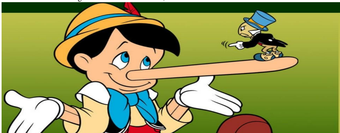
Figure 3: Pinocchio - cartoon character – Credit: Walt Disney

As I mentioned before, in order to get a higher ranking, universities can perform some illegal and unethical operations. Unfortunately, sometimes it is difficult to track these illegal operations because they can simulate the real ones and therefore, sometimes it is difficult to detect them in some cases.