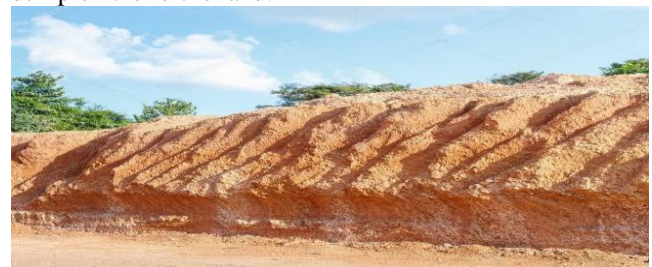
Fig 1: lateritic soil site

The glass industry waste (GIW) used in this research work was the combination of fine glass powder along with fine sand particles, in their gradation the mix was passing through 425micron and retained on 75micron. It was obtained from glass manufacturing industry from Bikampadi Industrial Area of Mangalore, Karnataka. Figure 3 shows the white colored GIW which was used in this study. This also readily obtained as a waste product, which the industry officials were used to dump on the fertile land.