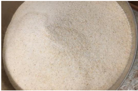
Fig 3: Glass powder