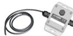
Fig.3 Appearance of 2420 Light Sensor Amplifier

The 2420 Amplifier provides generates an output signal up to 5,0 V and down to -2,5 V over the entire input supply voltage range (+3,8 to 28 VDC). The output signal is linearly provided by the light sensor with an offset of \pm <10 \mu\text{V} , meaning that 0 \mu\text{A} of input current yields a 0 V \pm <10 \mu\text{V} output voltage [5].