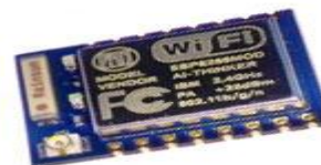
Fig.4 Appearance of SMART Connectivity Platform ESP8266 Version ESP 07

This module Version ESP 07, in comparison with other earlier versions, has an advantages number, it aligns the original cascades and antennas, which significantly increases the sensitivity and signal transmission radius. The supply voltage is 3,3V, the operating frequency is 2,4 GHz, the radiation power is 24dbm, the serial port speed is 115200 bauds by default, applied are 802.11 b/g/n wireless protocol, ceramic antenna, there is connector external antenna [7].