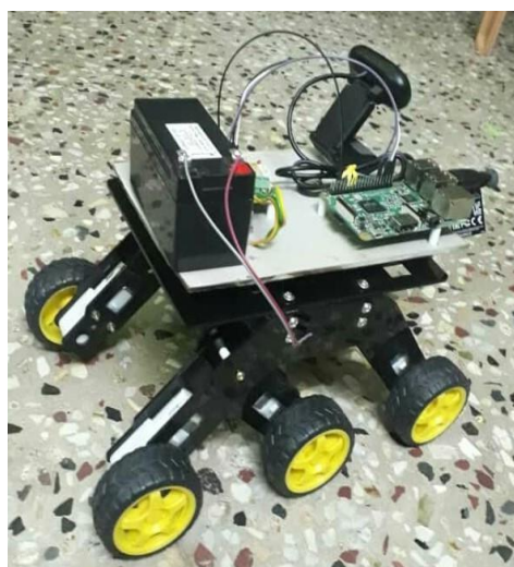
Fig: Rocker bogie setup