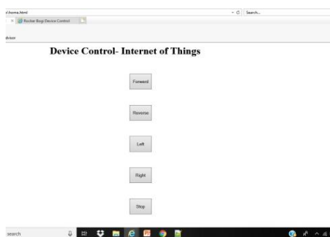
Fig: Sample webpage

It needs 6 wheels of desired size, and 4 rockers along with a bridge for the components to be setup. It also needs a webcam to monitor and display the captured scenes. The webcam should be of high quality to display live streaming videos.