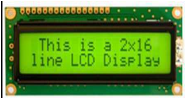
Fig 3: LCD Display

LCD shows diverse mode settings and set point alteration. Likewise 16 roast are separated to demonstrate speed yield. The LCD Display utilized here is 16 character by 2 line presentation. The 16 characters in the two lines are similarly partitioned to show directions and speed. In sub schedules 'Enter Speed' and 'Current Speed' message, set Speed esteem is shown on screen. In our venture LCD is interfaced with the port-0 (D0-D7) for example from stick number 32 to stick number 39. At the end of the day the information transport D0-D7 is associated with port-0 of IC 89s52. Stick RS is straightforwardly associated with Pin11 of controller and one increasingly another essential stick EN (LCD empower) is specifically associated with stick 14 of the controller. Then again stick R/W of LCD is associated with ground. The LCD interfacing is done here for demonstrating different showcase messages for the client.