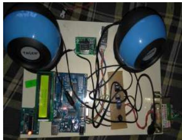
Fig 5. Output shown in hospital zone