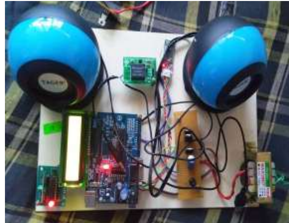
Fig 4. Output shown is school zone

In this area, the execution of the framework is tried. The Fig 4 and Fig 5 demonstrate the test directed close school and medical clinic.