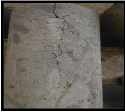
Fig.4: Failure pattern for 200 mm embedded length

The bond strength for M30 grade concrete is calculated and listed below: