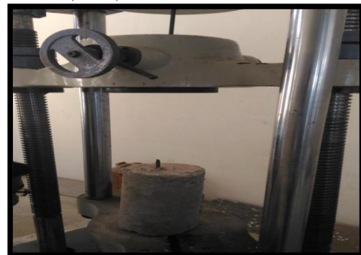
Fig.3: Failure pattern (Steel rupture)