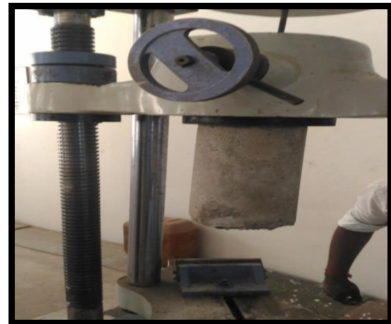
Fig -1and 2: Specimen Loaded on Universal Testing Machine