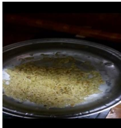
Figure 3- Result of selecting maggi recipe

We have shown our cooking pot in above figure which is placed on the induction and every food is prepared in this pot within the specified time.