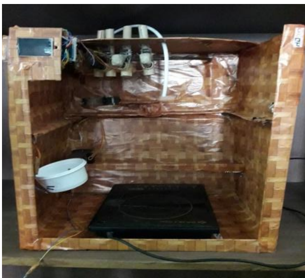
Figure 1- Front view of cooking machine.

Each ingredient is added in step to step wise manner with addition of oil and water with the help of motors and