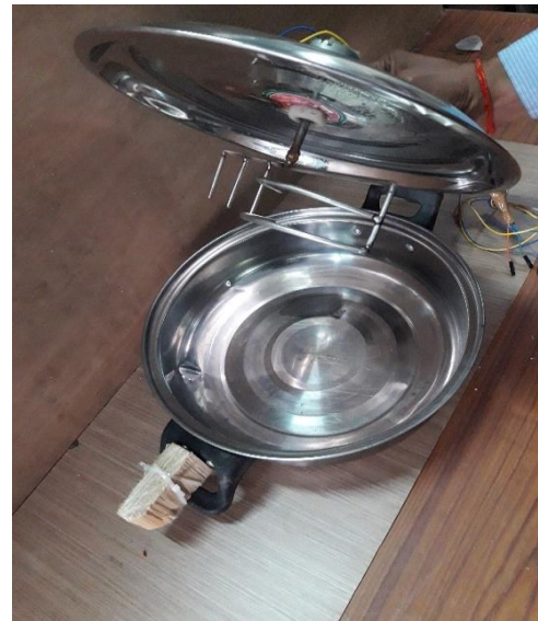
Figure 2- Cooking Pot Design

pumps respectively. Raw food and spices are also added in stepwise manner.[4]