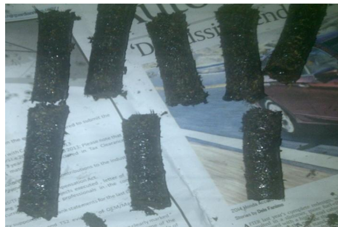
Fig. 3. Sample picture of the pellets.

10%, thus allowing them to burn with very high combustion efficiency. Further, the advantage of the pellet geometry size is that it can be fed to a burner by hand or pneumatic conveying. The sample picture of a pellet is shown in Fig. 3.