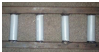
Fig. 2. Handheld Compressible Device

A handheld device was fabricated to help provide an easy means for compressing ground materials into pellet form without the stress or cost associated with the expensive pellet making machine. It is a compact hand operated press, that allows for mobility within the laboratory (Fig. 2). The pellet hand compressible metal produces uniform pellets in a mold and then it is ejected smoothly on a plane surface without danger of contamination. The hand compressible metal is a standalone accessory of 500 cm, which weighs 120 kg; customs in between sizes are available upon request. The hand device produces a compression force to help increase mechanical advantage steadily to a ratio of approximately 50 to 1 at the end of the press. A pressure of 250 N/m 2 is applied to the device which develops approximately 1000 in/min on the press ram adequate enough to produce firm pellets from powdered materials with binders.