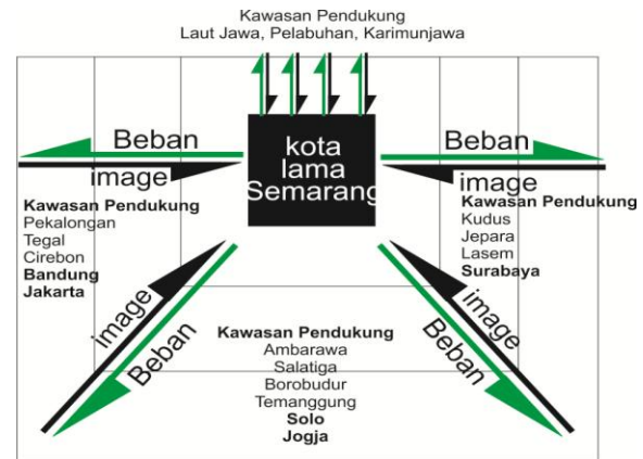
Figure 7: Supported Areas in Kota Lama of Semarang

To regulate the load capacity of Kota Lama, the division of roles between Kota Lama and other locations around Semarang have a typical thematic type. Thus, this division of roles has taken place including several films using the Kampung Melayu area (Layur Mosque), Semarang Chinatown, Lawangsewu, or Karangpanas Church in the Temple area.