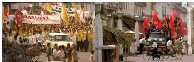
Figure 4: The setting of Gie film in Kota Lama area of Semarang

In addition to written references in the form of books and journals, several visual references from films have been produced in the Old City, Semarang such as Film Gie (2005), raising the true story of the life of Soe Hok Gie, a student activist from the University of Indonesia. This film has a historical background in 1966. It tells about the story of Soe Hok Gie of a Chinese descent who is strongly concerned about social and political issues. The cost of producing films reaches tens of billions of rupiah involving thousands of players including extras. The filming location is mostly in Semarang, even almost 80% of the filming is made in Semarang City. Filming locations include Kampung Melayu, Chinatown, Undip Campus and Kota Lama of Semarang. Soeprapto Street (the Blenduk church area), Kepodang road and Berok Bridge area. They become the locations of a film to make up the atmosphere of demonstration in the UI Jakarta Campus area.