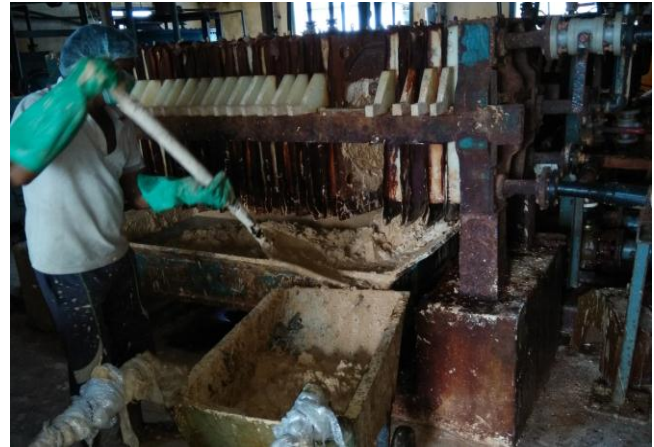
Fig(2). Filter tray, removing sulfur

After separate the sulfur is used for against production material are used in the industry this process complete recycling process the plants.