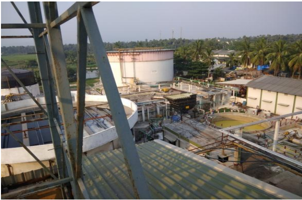
Fig(1).Plant ETP process

The operate of this item is to store the manufacture bio gas.. The plant consists of digested balloon to top of the digester and gas piping from the digester to a gas storage tank of gas storage tank to his engine.