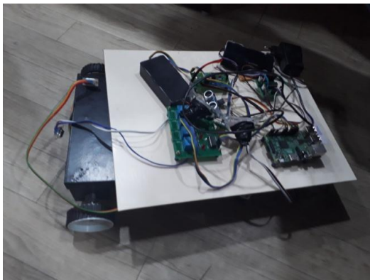
Figure 2: Hardware snapshot for an Robotic-Wheelchair Control Head Orientation and Eye Ball Movement Control with Health Monitor System

The Raspberry Pi controller will not be able to drive the heavy motors so that the driver circuit is required to drive the mechanism it will provide the necessary supply to drive the motor.