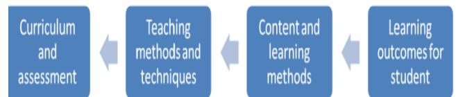
Fig 1 : Curriculum and Outcomes Mapping

Fig 1 shows the steps in curriculum planning based on the learning outcomes