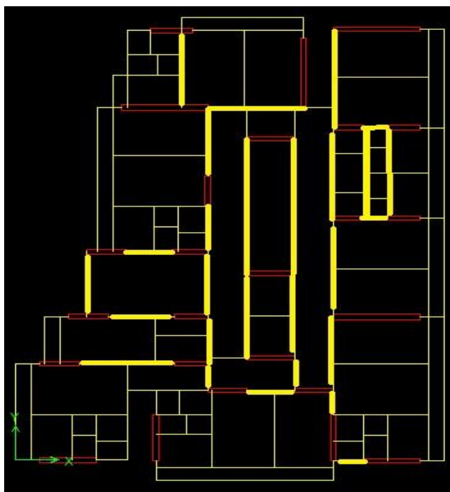
Fig. 3. Governing beams in wind load case

Reinforcement percentage is increased after applying wind load. Wind load develop the lateral stresses on the column which lead to bending of the column. Axial force, bending moment and shear force are observed after applying the wind load and it is conclude that axial force is less governing in wind load case. It is reducing as we go on upper storey. But bending moment is increased drastically. To resist this bending moment, percentage of steel in column has increased by 0.62 % averagely in each column. There for column sizes should get increase for high rise structure to accommodate increased reinforcement. As per IS 456-2000, Maximum percentage of reinforcement is 4% but practically it creates the congestion and in result poor concreting come in face. There for maximum percentage of the steel shall be 3 % to accommodate reinforcement properly and to have rich and high strength concreting. Wind load increase the stresses in column as well as in beam. Because cross wind load try to push the building which develops the stresses on framed member. Cross wind load create the coupling moment in inner frame of the structure. It shall have more depth and more reinforcement to resist coupling moment of the frame. In figure highlighted beams are the framed beam which highly govern due to wind load.