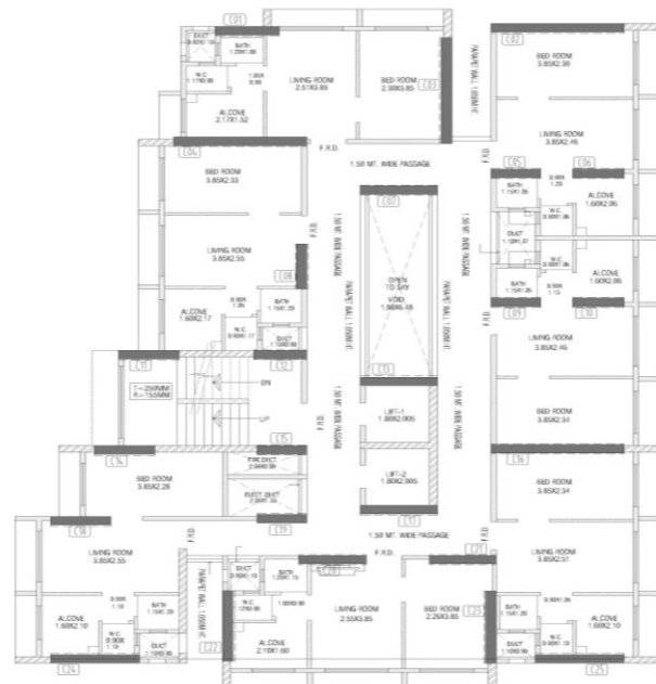
Fig. 2. Plan of building

A computational study was carried out using the Etab9.7.1 software. The model was used to study the global failure of the building structure.